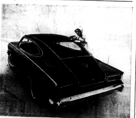
Marlin by Rambler—First Man-Size Sports-Fastback

But be ready for more—in the Marlin, Ambassador and Classic models. The most exciting choice of floor shifts—manual or Shift-Command Flash-O-Matic, teamed with mighty V-8s up to 327 cu. in. Try the sports-car Power Disc 3brakes (standard on Marlin) that resist fade on mountain grades, stop safely even in a trenching cloudburst. See the new leather-grained black vinyl seats available on Rambler hardtops. Look at the all-new Ambassador and Classic convertibles—or the American, west priced U.S. convertible.*