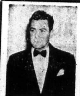
WALTER J. DEMPSEY Walter J. Dempsey Agency

Unique Super-Quiet bedroom air conditioner with revolutionary U-Mount feature installs in minutes! Simply set it on window sill (it's only 75 lbs.), level, close window, insert side seals, and plug in. Windowpane fits in the "saddle," locks major sound-producing parts outside, and seals cool, filtered and dehumidified air in. You sleep in quietest comfort! And you economize too, since the 5500-BTU Super-Quiet plugs into any 115-volt circuit and draws a measur 7 1/2 amps. See it today!