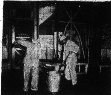
WINDOW BROKEN — During the height of the storm, a slide front window of the Norwood Gas Company was blown into the street. A crew of their own men are shown sweeping up the broken glass.